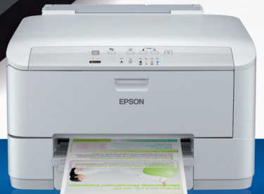
Epson WorkForce Pro WP-4011

The Epson WorkForce Pro WP-4011 printer delivers superb print quality in double-quick time with its highly durable Epson Micro Piezo™ print head and built-in networking capabilities for your office and home.